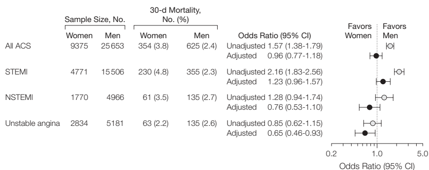
Figure 3. Unadjusted and Multivariable-Adjusted Plus Angiographic Disease Severity 30-Day Mortality Models in Women vs Men Across the Spectrum of ACS in Patients With Angiographic Data (n=35 128)

ACS indicates acute coronary syndromes; STEMI, ST-segment elevation myocardial infarction; NSTEMI, non-STEMI; CI, confidence interval. Odds ratios of women vs men (and 95% CIs) obtained through logistic regression include age, Killip class, age \times Killip class, heart rate, systolic blood pressure, weight, height, history of congestive heart failure, history of myocardial infarction, history of coronary artery bypass graft surgery, history of diabetes, history of percutaneous coronary intervention, history of hypertension, current smoking status, and former smoking status, along with type of ACS and angiographic disease severity. Unadjusted and adjusted STEMI, NSTEMI, and unstable angina include ACS \times sex interaction to obtain the sex effect conditional on ACS categories. There was no significant differences in overall 30-day mortality between women and men under the Bonferroni-adjusted significance level of P = .005 ( = .05/10 ).